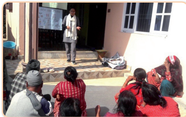
Covid-19 Awareness in the Community