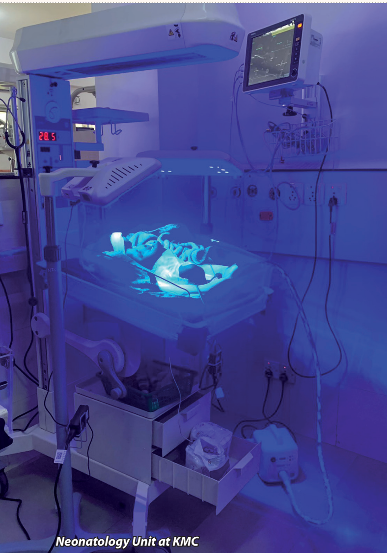
Neonatology Unit at KMC