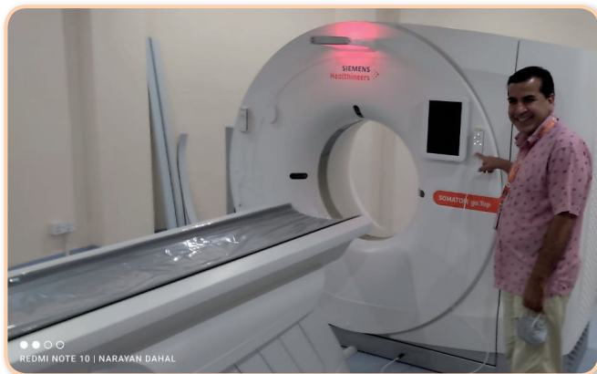
128 Slice CT Scan Installed at KMC