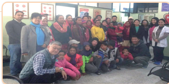
Eye camp organized at Out patient department of Ophthalmology, KMCTH