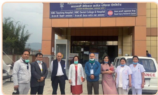
National Covid-19 Task force commander, Director General of Health visiting KMC Duwakot

and Rooms at Duwakot are used for quarantine purpose of the service providers.