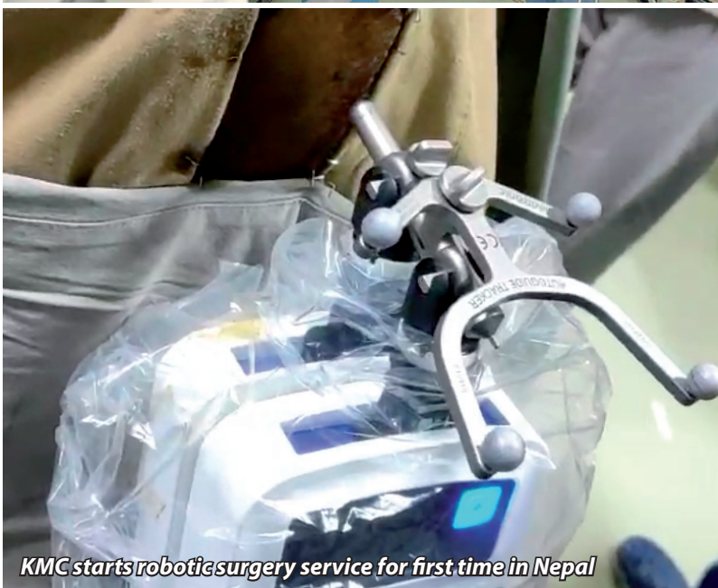
KMC starts robotic surgery service for first time in Nepal