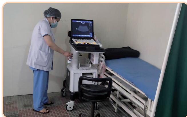
USG started at emergency department at KMCTH, Sinamangal