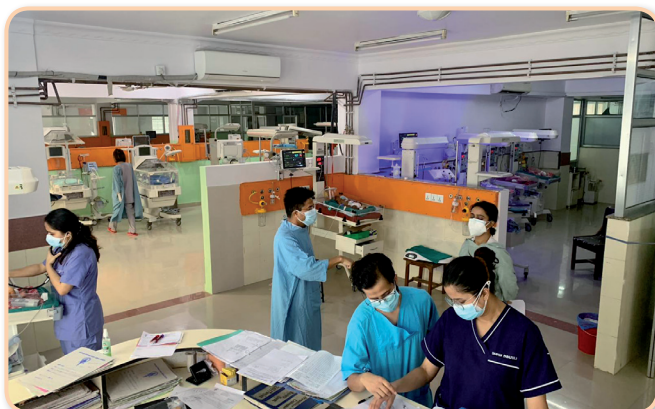
New Neonatal Unit at KMC