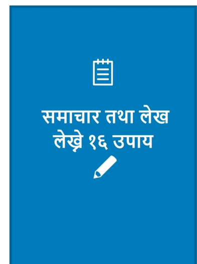
"16 story ideas" for reporting on road safety, translated into Nepali